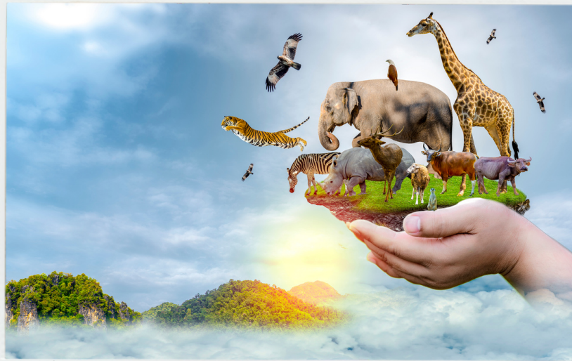
Protects animals and plants